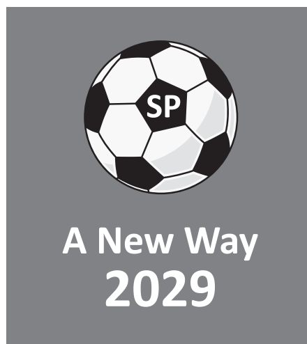
Figure 1: Logo for A New Way 2029